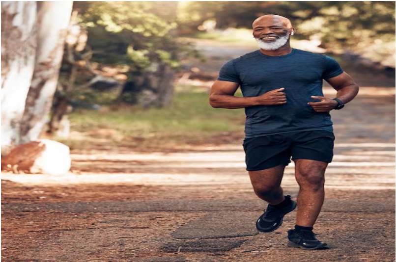
Exercise most days of the week

If you are at a healthy weight, work to maintain it by exercising most days of the week and choosing a healthy diet that's rich in fruits, vegetables and whole grains.